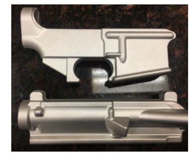
Actual product photo of forging with surface finish as shown